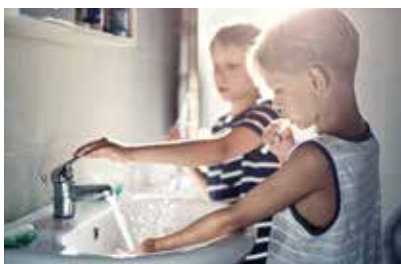
SAFE DRINKING WATER

Safe, hygienic and secure distribution of drinking water is essential to our everyday life. Certified to national as well as international safety and quality standards, our water supply systems are a preferred choice for the safe delivery of drinking water in homes and buildings throughout Europe. Radopress is an universal pipe system applicable in all water pressure installations . The embedded aluminium layer makes them incredibly resilient against temperature changes, pressure stroke loading, torsion and tension.