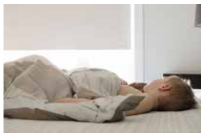
SILENT WASTEWATER DISCHARGE

Safe, hygienic and secure distribution of drinking water is essential to our everyday life. Certified to national as well as international safety and quality standards, our water supply systems are a preferred choice for the safe delivery of drinking water in homes and buildings throughout Europe. Radopress is an universal pipe system applicable in all water pressure installations . The embedded aluminium layer makes them incredibly resilient against temperature changes, pressure stroke loading, torsion and tension.