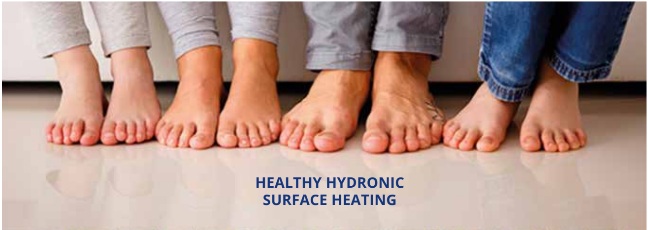
HEALTHY HYDRONIC SURFACE HEATING