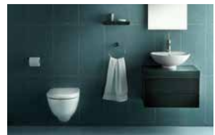
FLUSH&FLOW CISTERN SYSTEM

Pipelife’s Flush & Flow line of cistern systems combine functionality with great design options. Our various cisterns can be installed in different environments . To encourage environmental protection and water saving, we also offer an ecological version of our flushing cistern setting the flushing water volume from 2 to 6 litres . The smooth and reliable operation, easy installation and a minimum 25-year availability of spare parts are just some of the system’s key advantages.